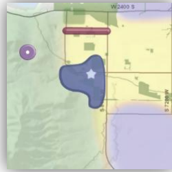
Scenario 2 Consistent w/current Plan