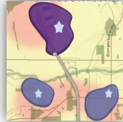
Scenario 3 More Centered