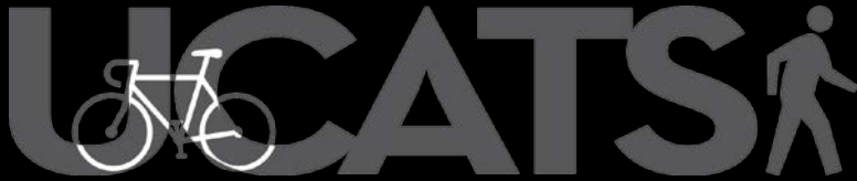
UCATS Projects - Ranking Matrix